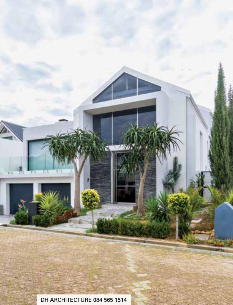
DH ARCHITECTURE 084 565 1514

ABOVE: The owners required a homely yet sophisticated family home, and DH Architecture ensured that their dream was fulfilled through the finishing and detailing aspects and design of the house. The main focus was on the open-plan living areas and kitchen that connect to the outside spaces. The dramatic double curved staircase in the double-volume foyer was a specific request from the owners.