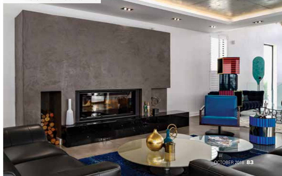
FIRE AND GAS LIFESTYLES 021 852 7173

“The family created a space that works for them.”